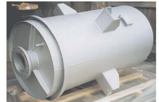
above: 18t/hr Blow Off Silencer for 500 °C