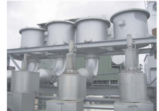
below: safety valve blow off silencer