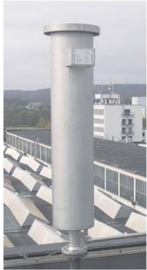
2 t / hr Steam - Blow Off Silencer