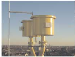
60 t/hr blow off silencer during lorry loading