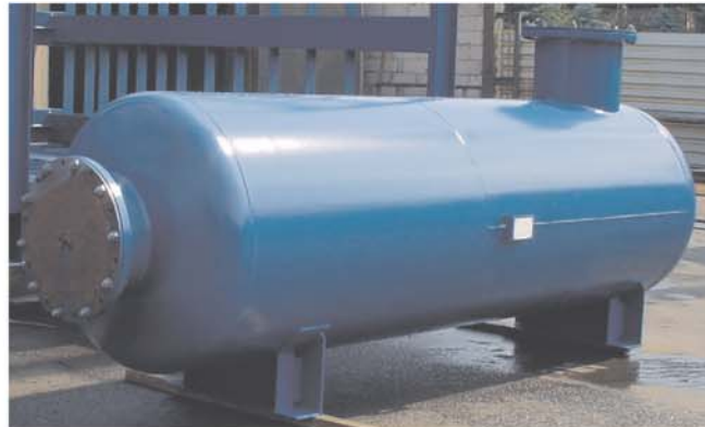
pressure vessel silencer. resonance / absorption type for roots blower