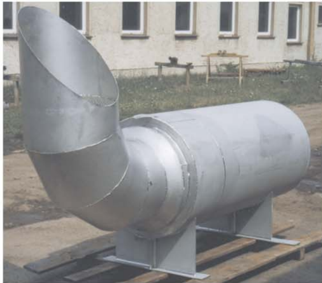
SS - Vent Silencer for 5.000 Nm 3 /hr of O 2