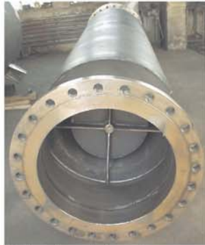
30t/hr steam inline silencer