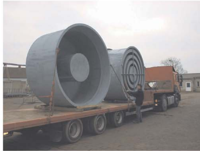
190t/hr steam blow off silencer - divided for transport