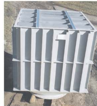
Silencer upstream ventilator, designed for +/- 9.500 Pa. Stiffeners acc. to stacical analysis