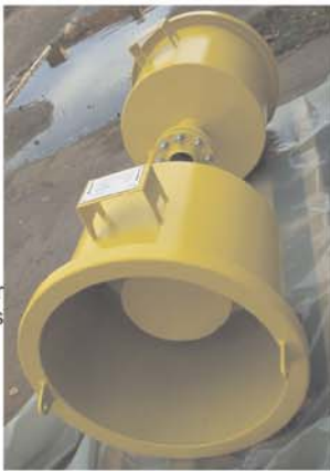
blow off silencer for natural gas