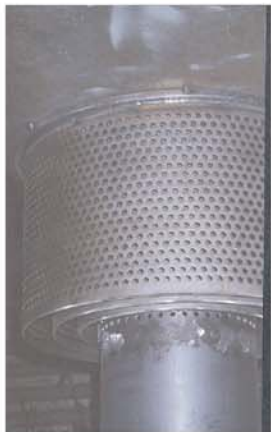
Spezial perforated expansion stages for max. loss of noise