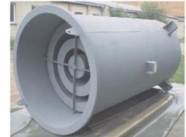
start up steam silencer with insertion loss of 60 dB