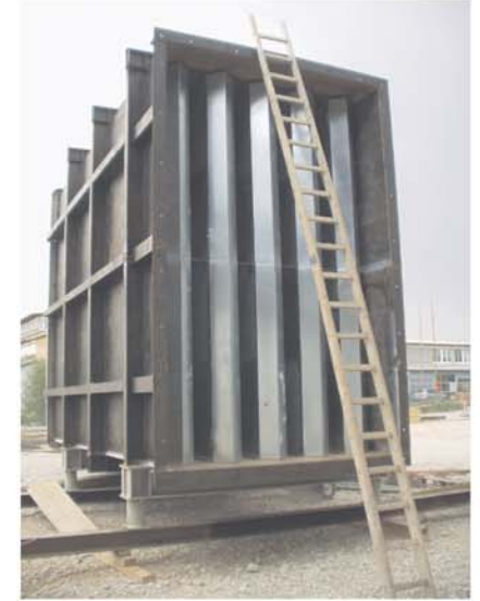
Absorption silencer after HRSG package