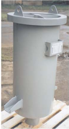
12 t / hr Steam - Blow Off Silencer