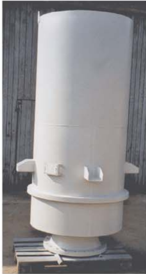
30t/hr Blow Off Silencer