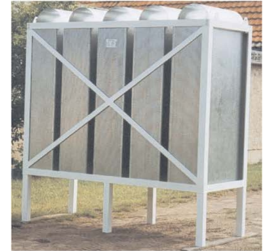
Preassembled Intake Silencer splitters for concrete- stack; 14.000 Nm 3 /hr.