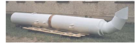
2 stage Vent Silencer for Insertion Loss of > 60 dB