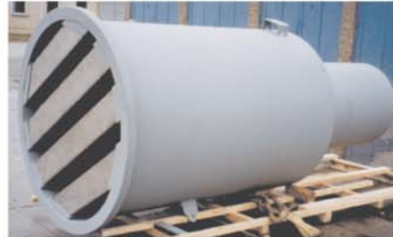
35 t/hr, 520°C Steam - Blow Off Silencer