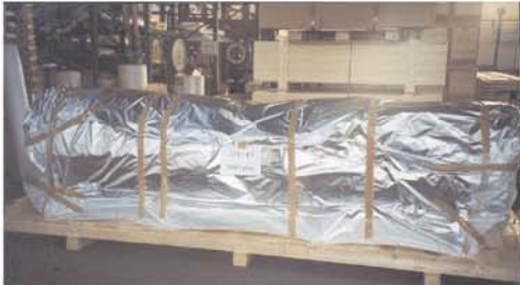
Silencer with pressure expansion stages for venting of high temperature steam. Seeworthy packaging for transport to Thailand.