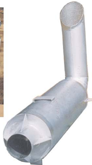
Stainless Steel Silencer for venting of pure oxygen with special mineral wool and inside treatment