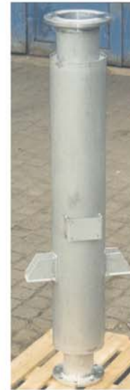
SS-Inline Silencer for 4bar O 2