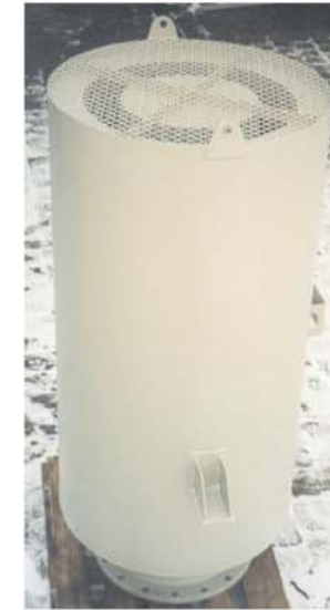
Air Blower Bypassilencer 20.000Nm 3 /hr