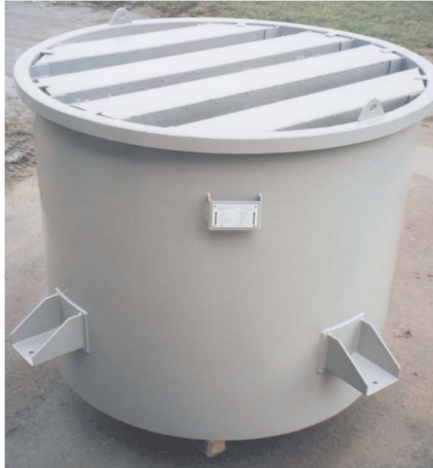
above: 50 t/hr Steam- Blow Off Silencer