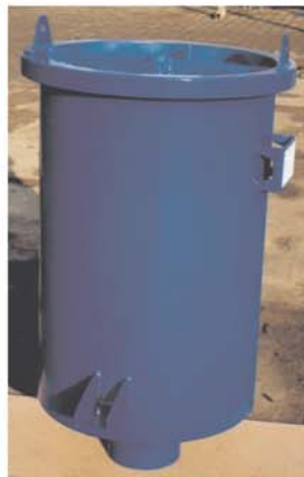
15 t/hr Blow Off - Silencer